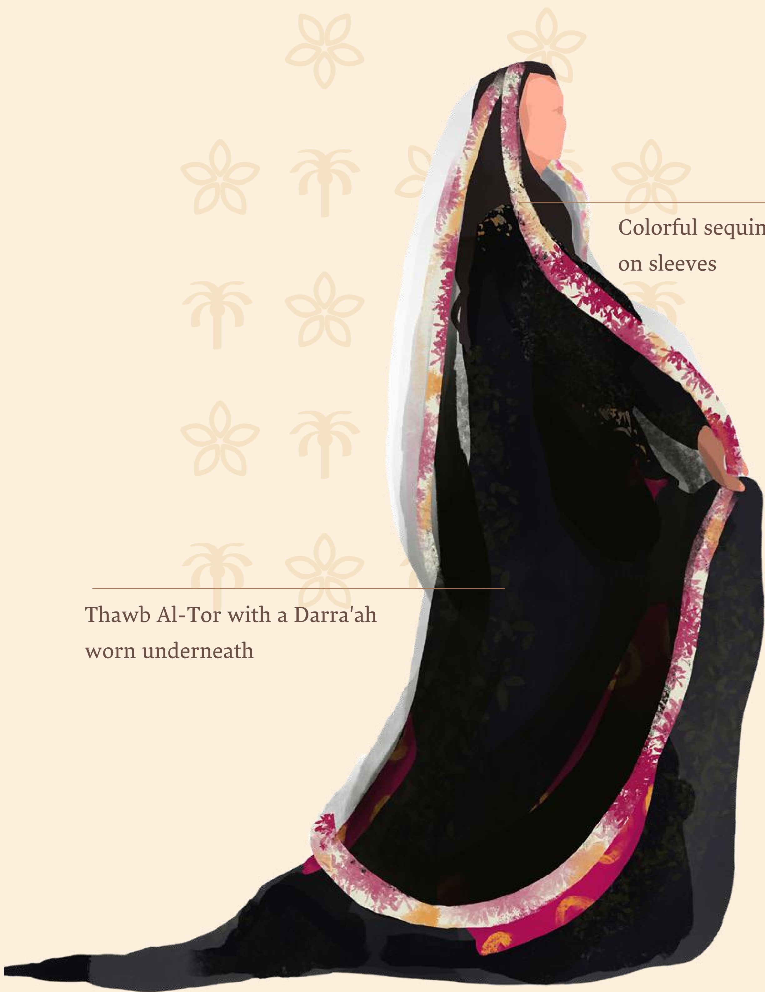
Colorful sequin trim on sleeves